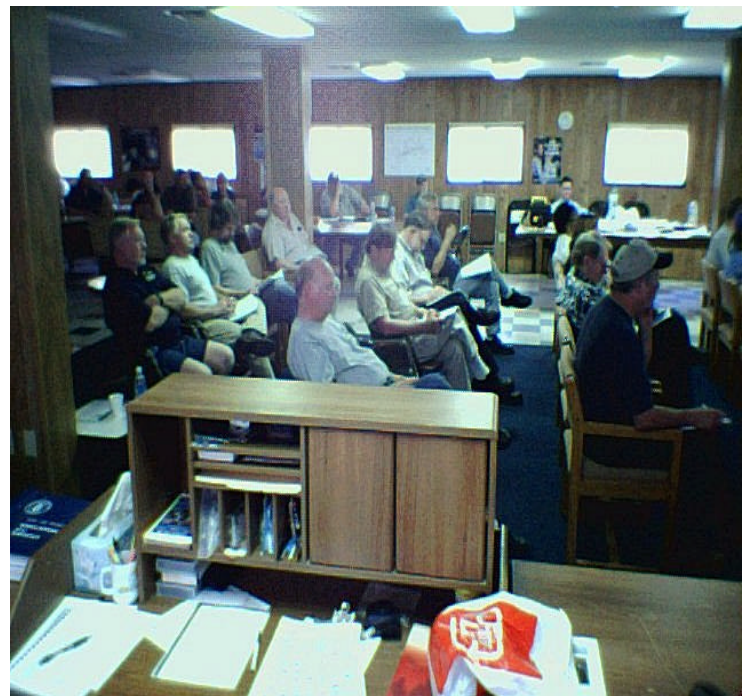
A great turn out for the March Meeting. There were several agencies represented.

I don't have anything official, but some of the agencies that participated were The Rhea County Sheriff's Department, Rhea County Rescue Squad and anytime that